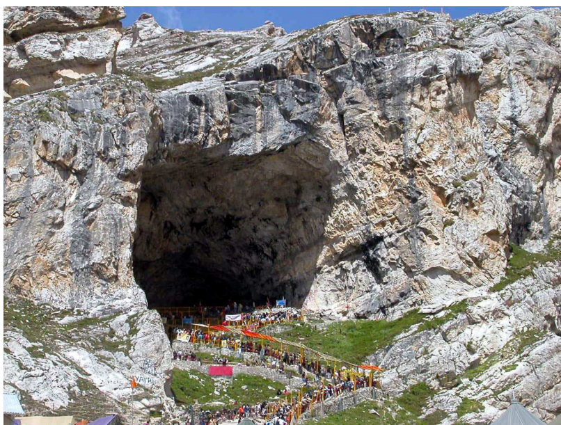
Amarnath Cave Shrine